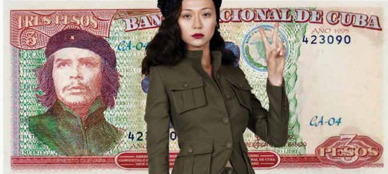
Giacca & Pantaloni JEAN PAUL GAULTIER Cappello FRANCESCA LIBERATORE