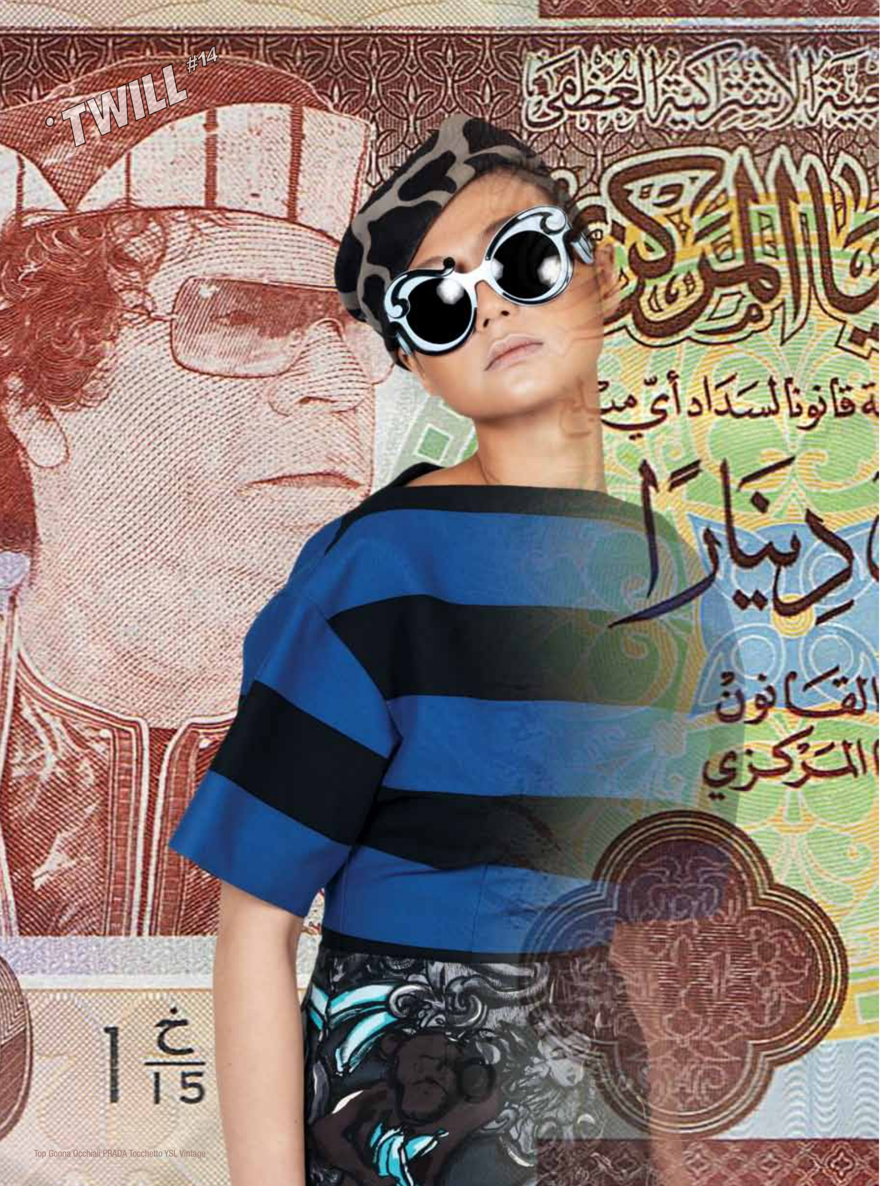
Top Gonna Occhiali PRADA Tocchetto YSL Vintage