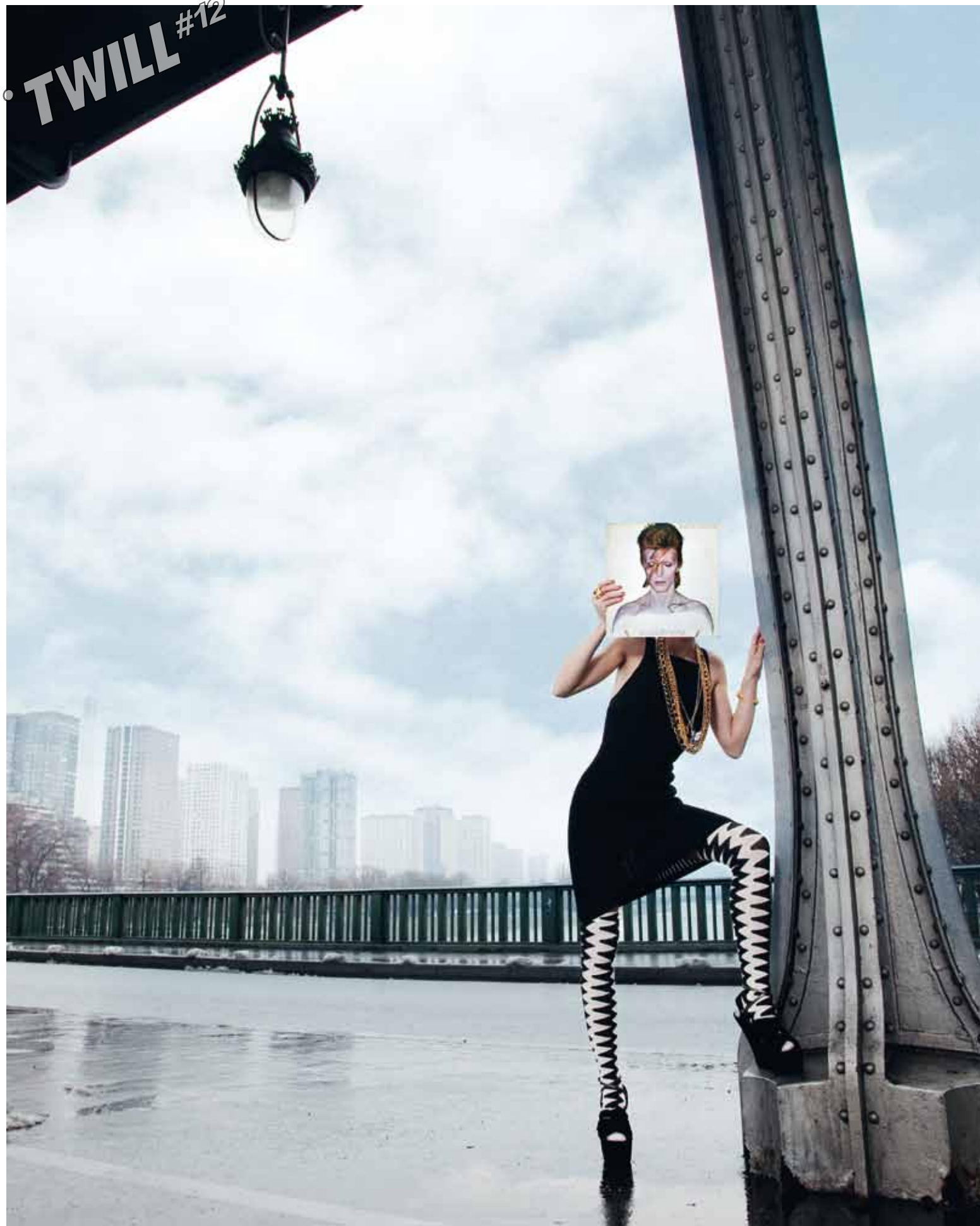
DRESS, AZZEDINE ALAIA. STOCKINGS, BERNHARD WILLHELM. NECKLACES, YOSHIKO CREATION AND AMERICAN APPAREL. SHOES, AZZEDINE ALAIA.