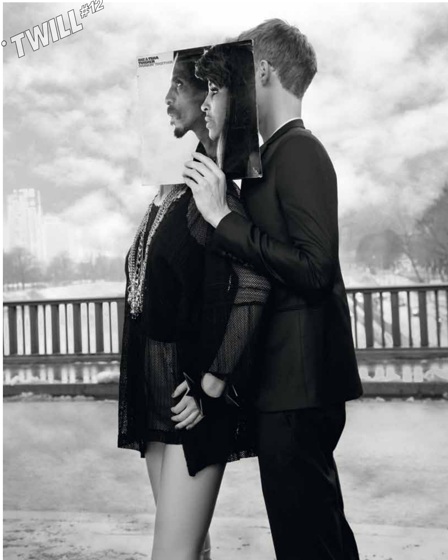
SHE WEARS SWEATSHIRT, BLAAK. LEGGINGS, REPETTO. NECKLACES, YOSHIKO CREATION & AMERICAN APPAREL. BRACELETS, POPY MORENI. HE WEARS JACKET, KOSTAS MURKUDIS. TROUSERS, RAF SIMONS.